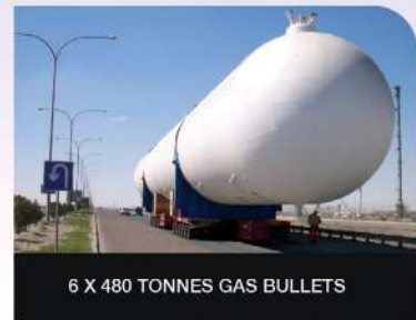
6 X 480 TONNES GAS BULLETS