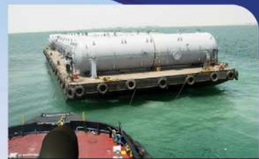
DESALTER VESSELS MOVED FROM BAHRAIN TO KUWAIT