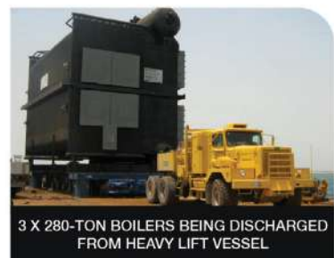
3 X 280-TON BOILERS BEING DISCHARGED FROM HEAVY LIFT VESSEL