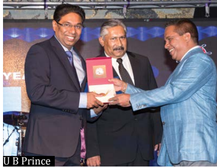
U B Prince