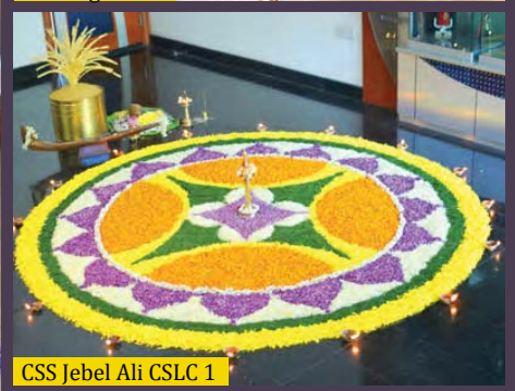
CSS Jebel Ali CSLC 1