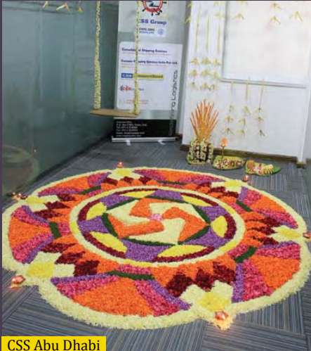
CSS Abu Dhabi

In a thrilling competition, this year also CSS Abu Dhabi won the Mahabali Crystal Award for the best flower carpet (Pookkalam).