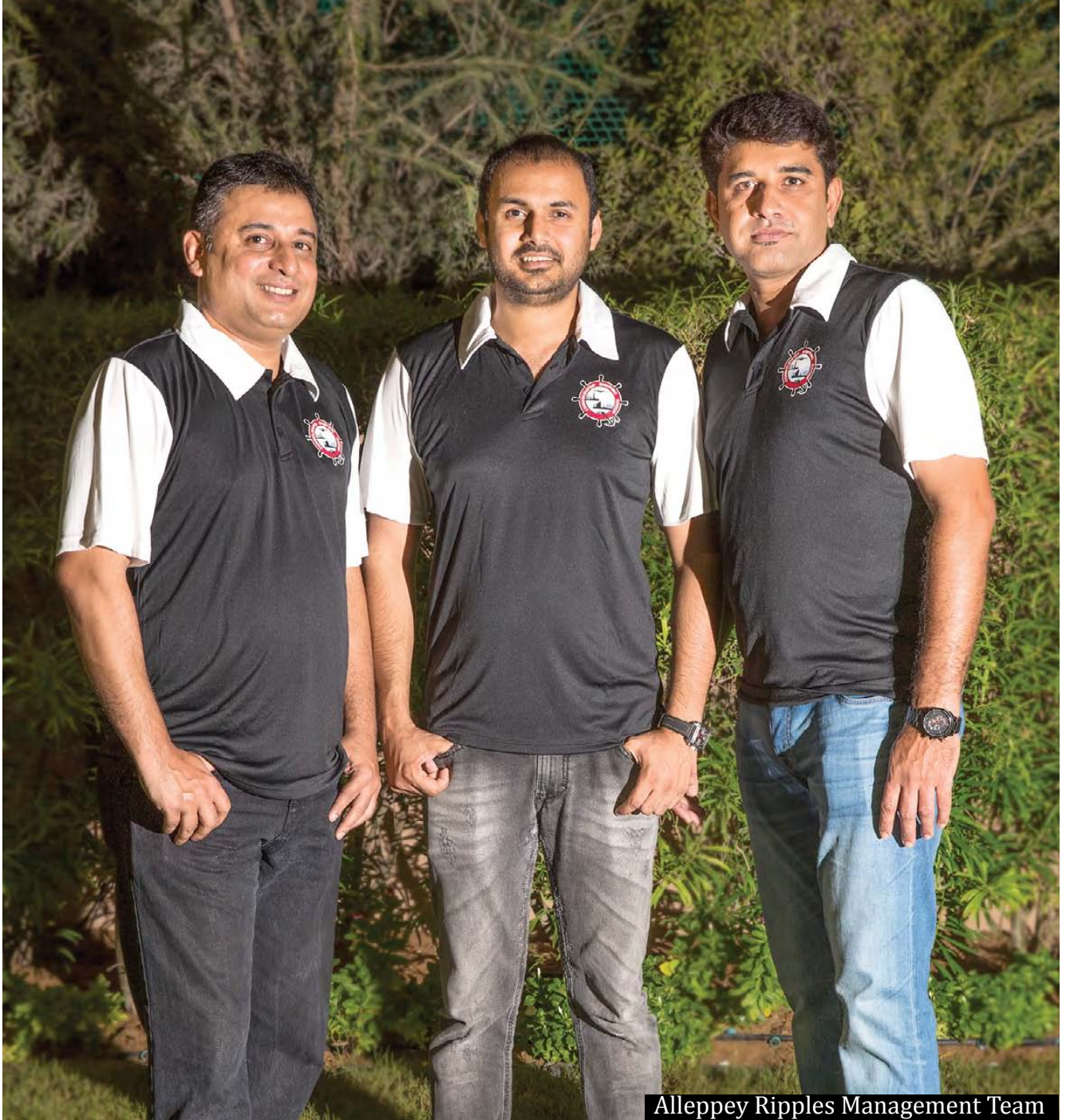
Alleppey Ripples Management Team