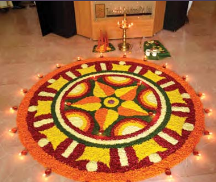
Twin info solutions Pvt. Ltd

Every year, in connection with Onam celebrations, at CSS Group, a competition is being held among all offices for bagging the best creator of Pookkalam on the main day of Onam, ie; Thiruvonam. Each office engages their best team to making amazingly beautiful designs only with flower and take photographs to be sent to a judging panel comprising of renowned people from art, music & cinema. Here are some snaps from the competition arena.