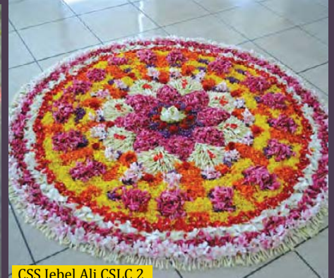
CSS Jebel Ali CSLC 2