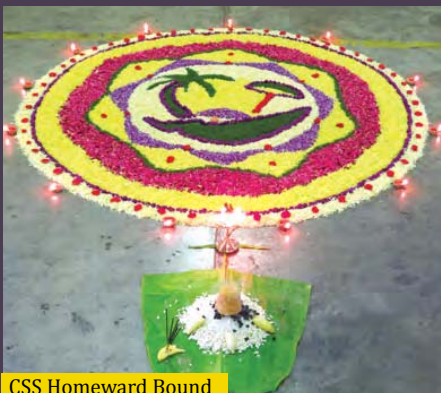
CSS Homeward Bound