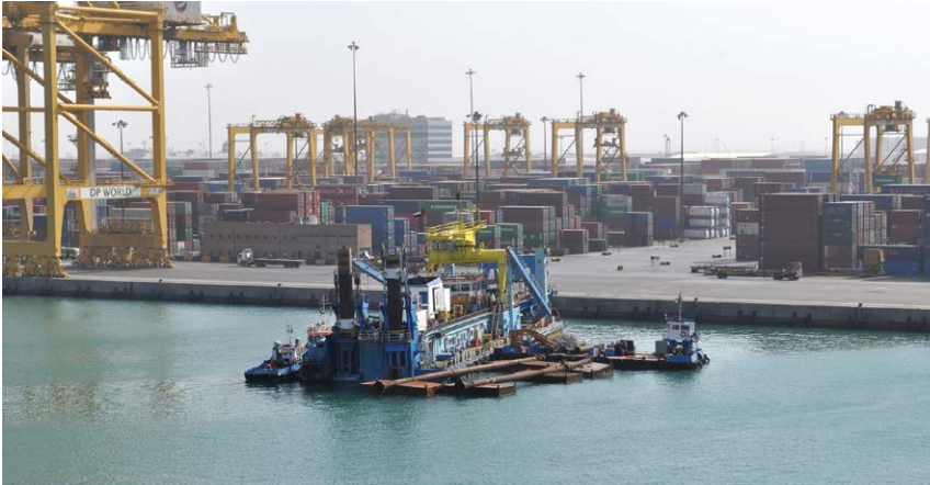
National Marine Dredging vessel dredging at Jebel Ali Port

D P World recently announced that it has successfully completed the largest dredging programme at its flagship Jebel Ali Port in 10 years, allowing the port to handle more big vessels at the same time by deepening the draught.