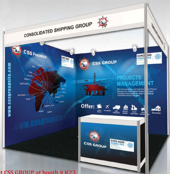
Please visit CSS GROUP at booth # K23.

"Breakbulk China is an excellent avenue to network and connect with over 130 exhibitors and sponsors that provide specialized products and services within the breakbulk and project logistics sector. Exhibitors and sponsors include specialized ocean carriers, freight forwarders, ports/ terminals, logistics providers, ground transportation, heavy air, export packers, equipment companies and more. Our presence in Breakbulk China is vital as we are able to network and connect with business associates from around the globe."