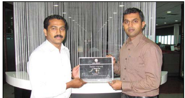
Animon - Documentation Department given by Rowmahs, Supervisor- Documentation