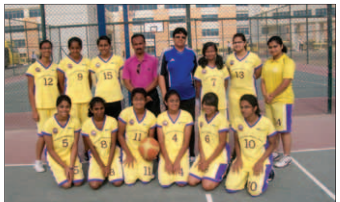
Senior Girls Basketball Team: CSS Group recently sponsored the girls Basket Ball team from 'Our Own English High School', Al Warqa, Dubai, United Arab Emirates.